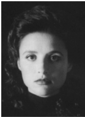
Elaine, the shamelessly shallow moocher

GEORGE: Glorious, isn't it? It was so perfect--he logged off right after he sent the job to the printer, and there were people waiting like vultures for his computer. I snuck up there and stood nonchalantly by the printers, playing it cool, watching and waiting . . . he never saw a thing. It was MASTERFUL! Smooth as silk, I tell ya . . . (smiles blissfully to himself)